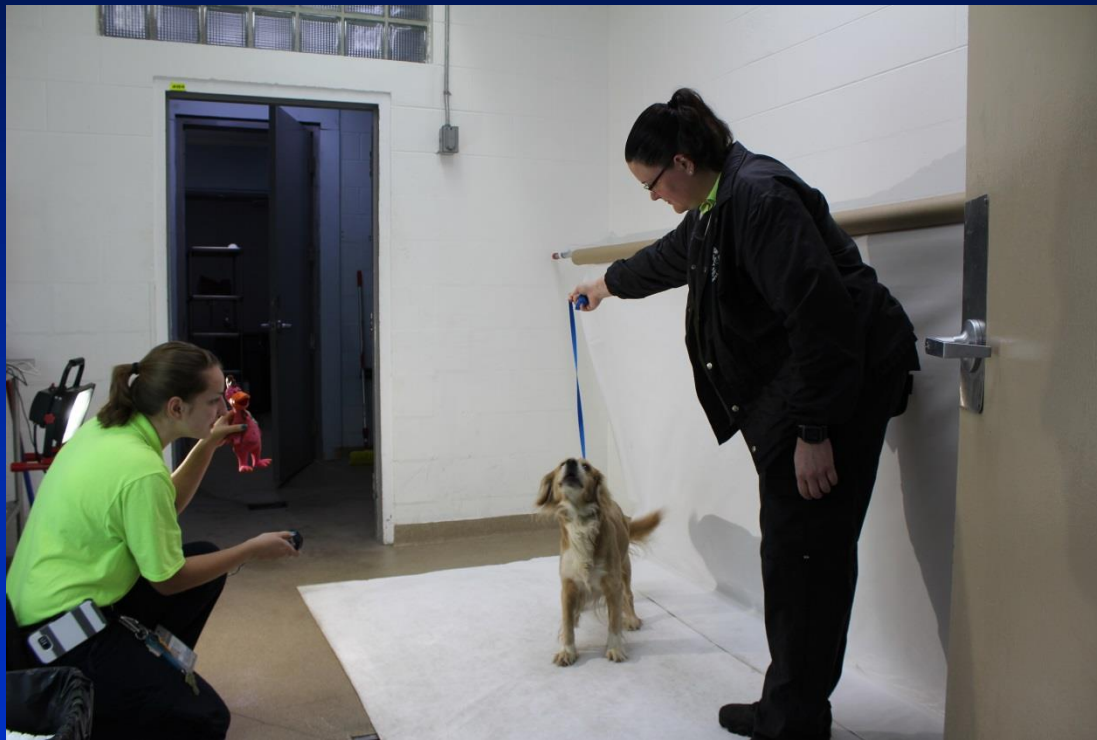
Photo Area Improvements