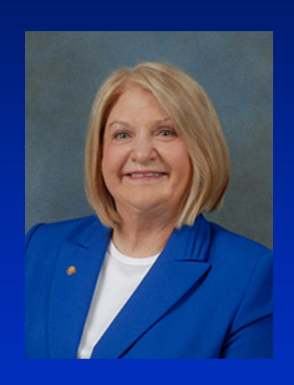
Senator Linda Stewart District 13