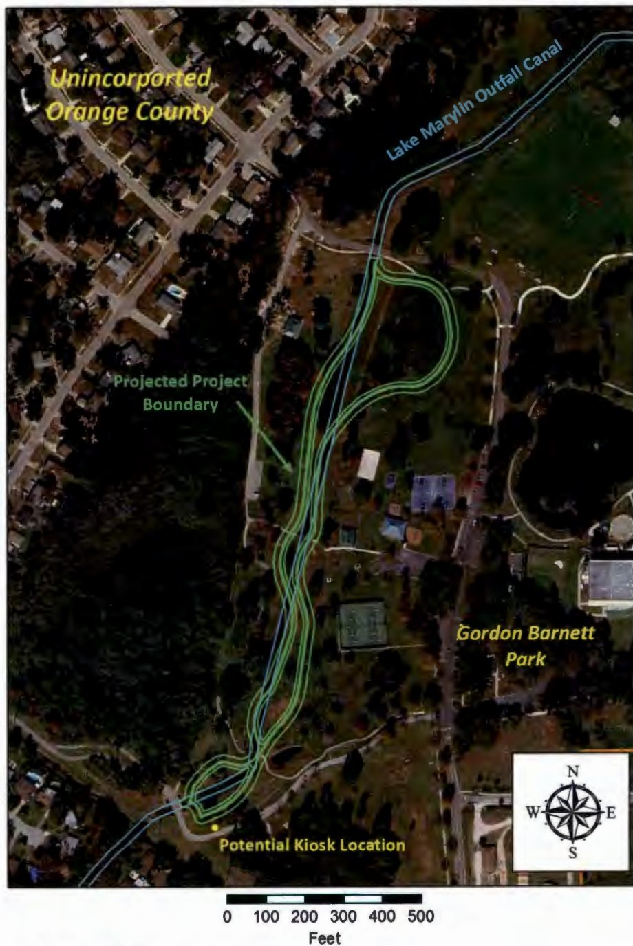
Figure 2. Project Site Plan, Lake Lawne Stormwater Irrigation Facility at Barnett Park, Orange County, FL.

Orange County Environmental Protection Division (07/06/2016)