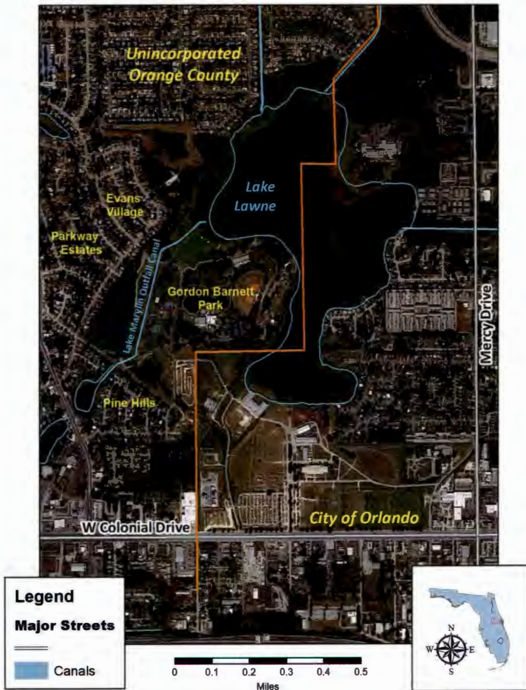
Figure 1. Site Location Map, Lake Lawne (WBID 3004C) Stormwater Irrigation Facility at Barnett Park, Orange County, FL

Orange County Environmental Protection Division (07/06/2016)