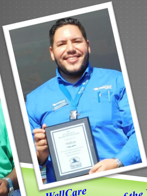
WellCare Business Pillar of the Year