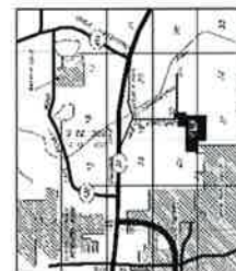
VICINITY MAP BY PEC, INC.

SUB-PHASES 1-5 30-22-32 31-22-32 25-22-31