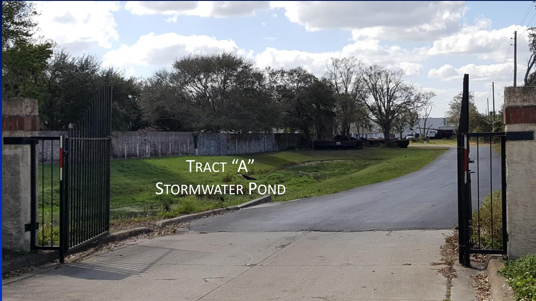
TRACT "A" STORMWATER POND