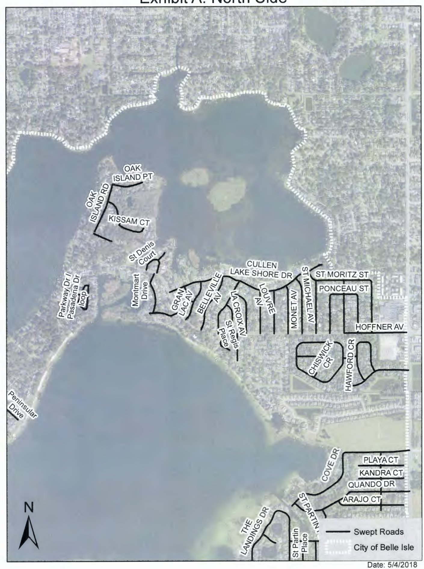
Exhibit A: North Side