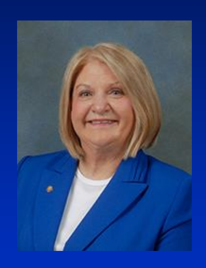
Senator Linda Stewart District 13