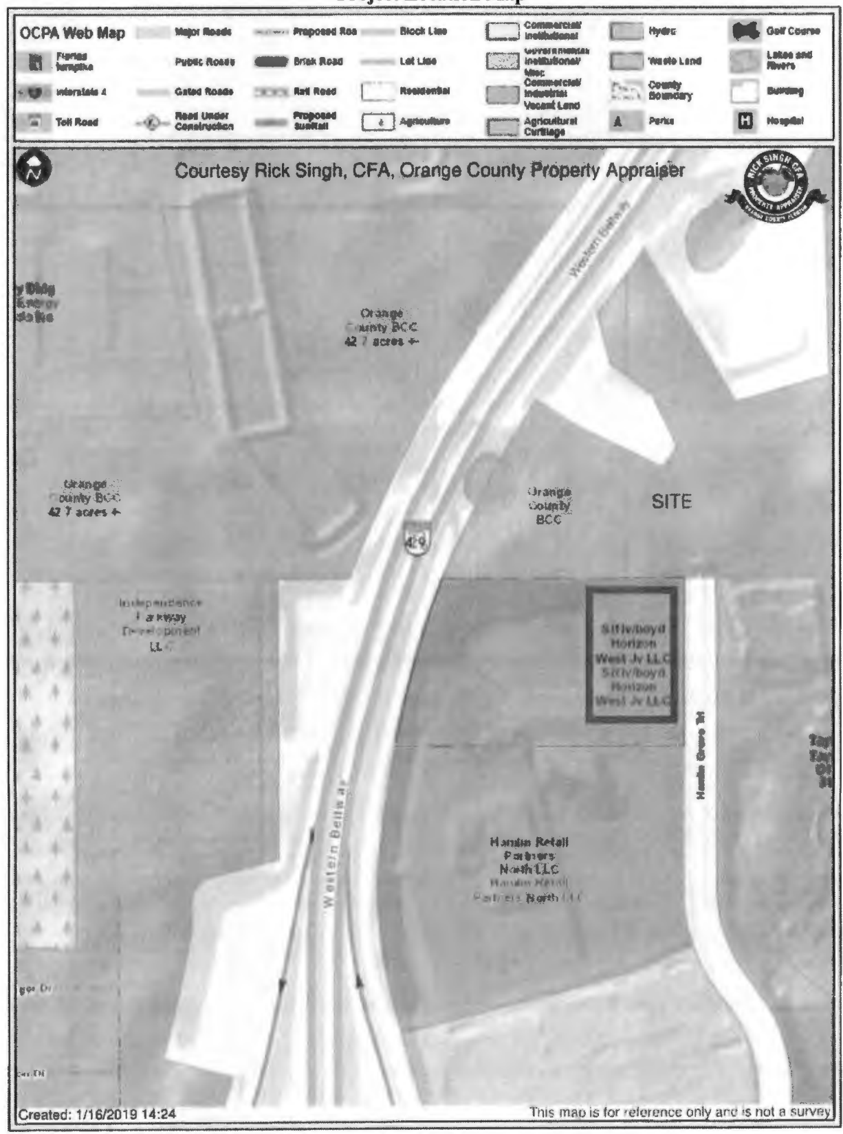
Page 10 of 13