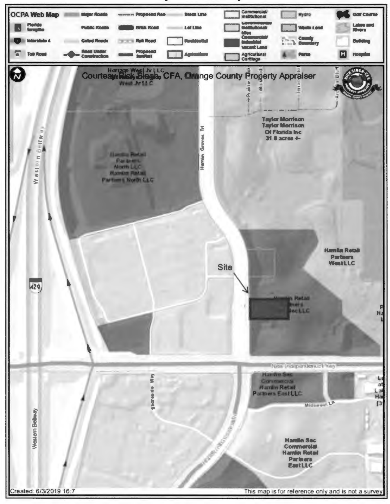
Exhibit "A" "Taco Bell/Pizza Hut at Hamlin" Project Location Map