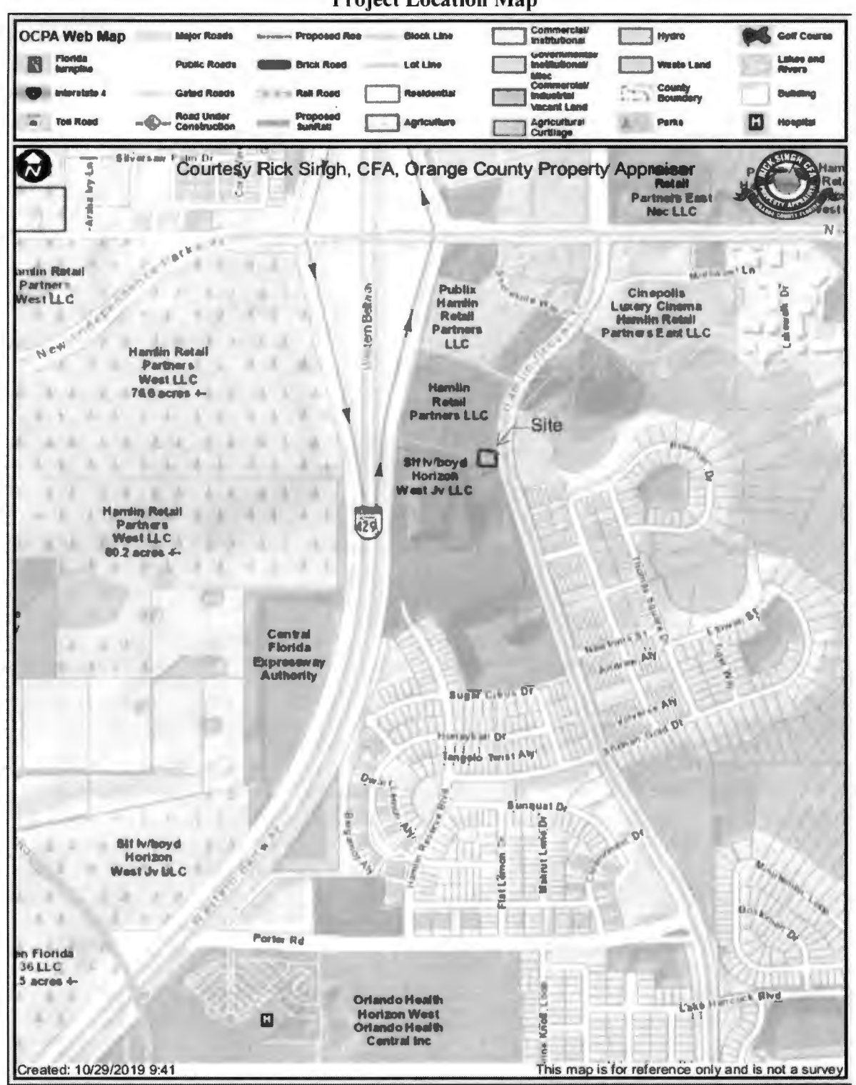
Exhibit "A" "Hamlin Family Dental" Project Location Map