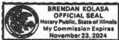
Name of Notary, Typed, Printed, or Stamped