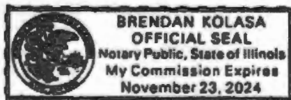
Name of Notary, Typed, Printed, or Stamped