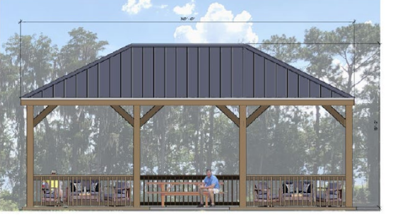
2 PAVILION ELEVATION - FRONT